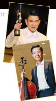
Andy Lau, MH, JP

Hong Kong's Second Wave film director Wong Kar-wai is known for stylised and emotionally resonant films including Days of Being Wild , Chungking Express , Fallen Angel and The Grandmaster . He was the first Chinese director to win the Best Director Award at Cannes Film Festival for Happy Together .