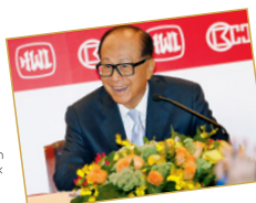
Sir Ka-shing Li, GBM, KBE, JP