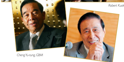
Lee Shau-kee, GBM