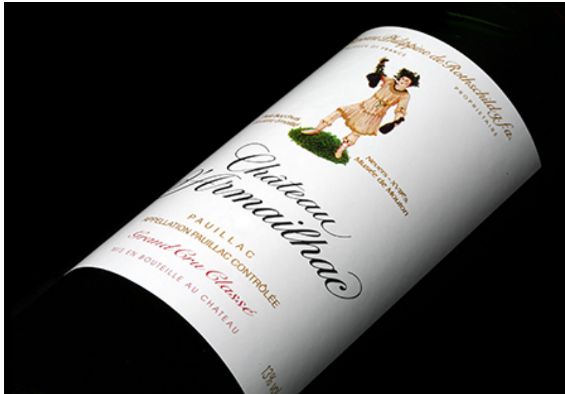
Château D'Armailhac 1012